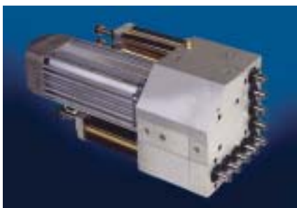
9 Spindle horizontal Vertical Drilling Unit, 5x5 'L' Shape.